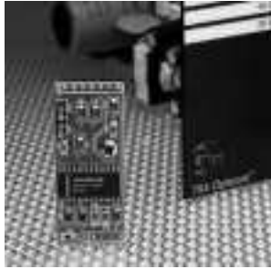
Opticom™ Model 832 Communications Daughter Board